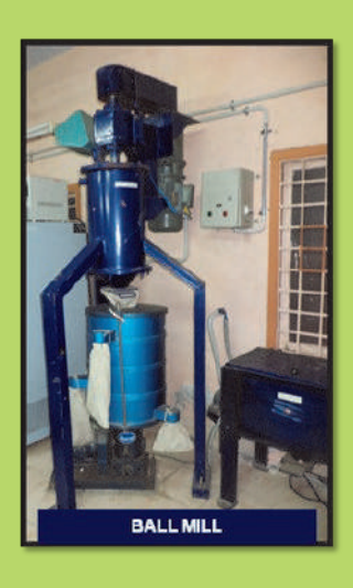
Instruments at Faculty of Agriculture