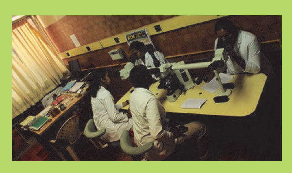
Oral Pathology P G Lab