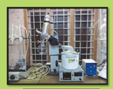
ROTARAY VACUUMFLASH EVAPORATOR