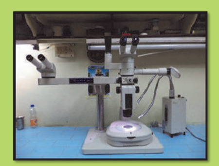
TRINOCULAR STEREOSCOPIC ZOOM MICROSCOPE