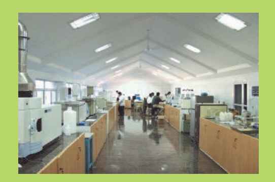
Instruments Lab - Marine sciences